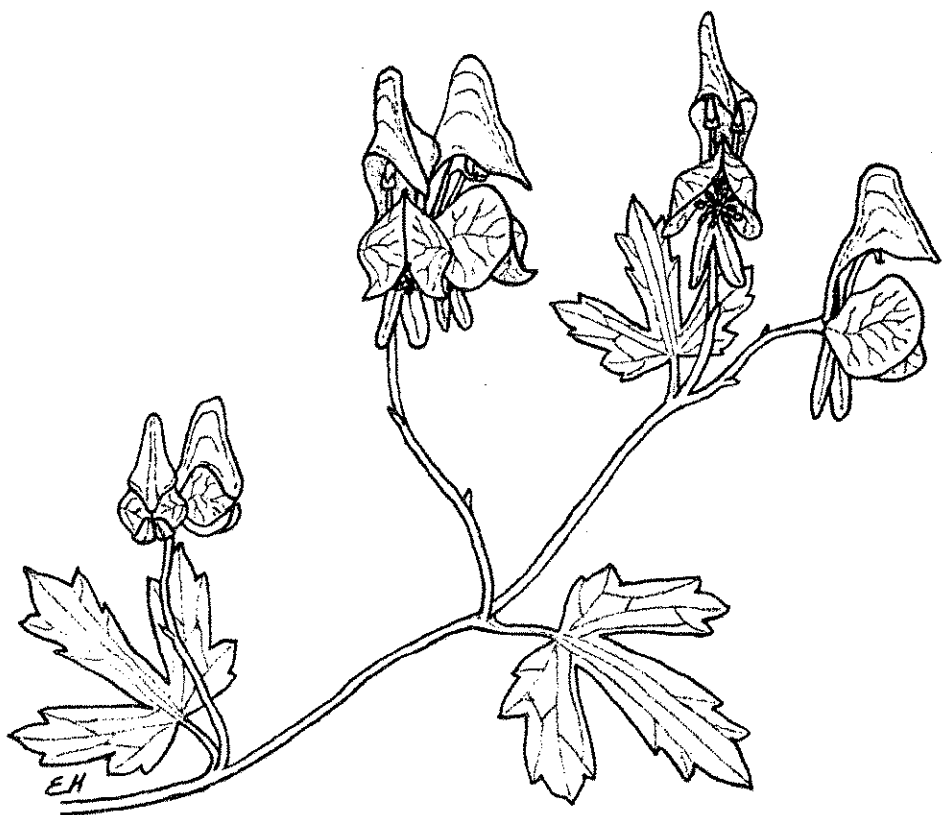
Monkshood Aconitum uncinatum