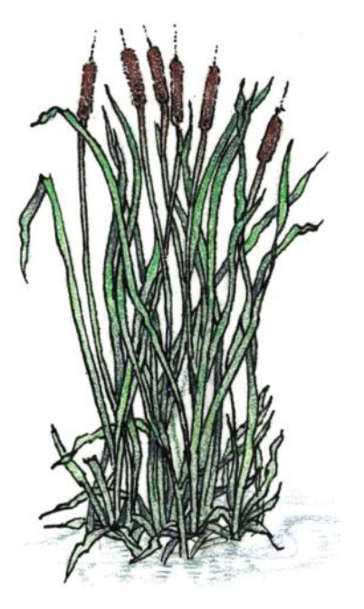
Illustration from University of Wisconsin-Extension and the Wisconsin Department of Natural Resources