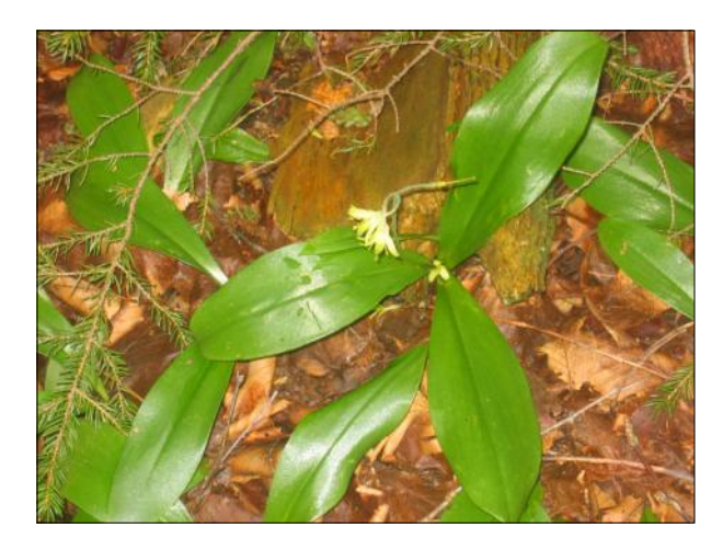
way up, around, and down pretty sections of Rough Butt Bald. Plenty of blueberries and Rhododendron represented the last of the wildflowers as Zack and I trudged wearily to our waiting car.

Overall, while there was a nice variety of wildflowers to be seen, they were not abundant and the trail was certainly not the most attractive or pleasant for a walk in the woods. Out and back walks at either end of this hike would make better trips, but if you are working on the Pisgah 400, or hiking the Mountains-to-Sea trail end to end, you might as well do this section when there are wildflowers to brighten the scenery.