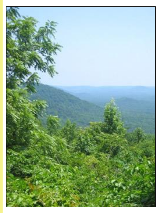
Due to state hunting schedules, the date for our fall trip has been changed.

Named for the Catawba (part of the Sioux nation) word for lance or spear, the Uwharries are an ancient mountain range. Estimated at more than 500 million years old, the soft rolling hills of the range once stood at nearly 20,000 feet. Forces of erosion over those years have worn them done to less than 1,000 feet and exposed layers of rock in great variety. it covers, the Uwharrie National Forest occupies just less than 53,000 acres, more than 80% of which is located in Montgomery County. Davidson has a small portion and the Birkhead Wilderness is in Randolph County.