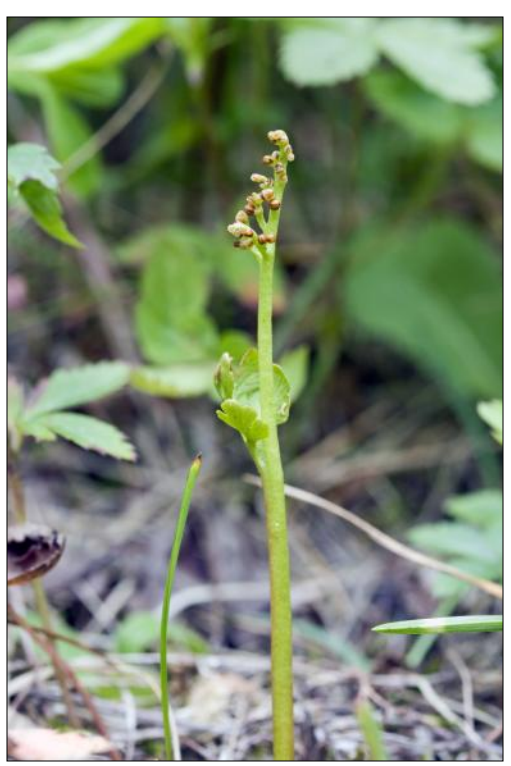
Botrychium simplex var. simplex, least moonwort