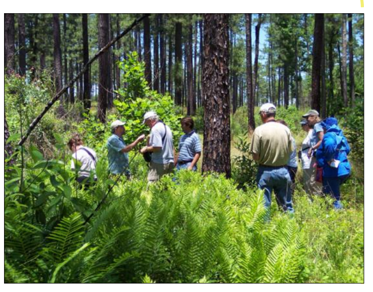
Exploring a wetlands site