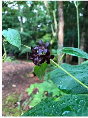
Carolina Spiny pod