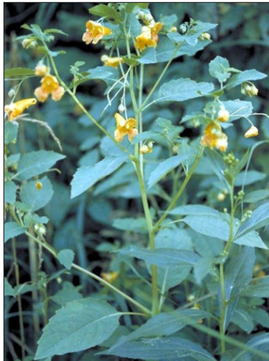
Orange Jewelweed Impatiens capensis

Great Blue Lobelia, Lobelia siphilitica : part sun to part shade, moist soil. A “cousin” of the Cardinal flower, Lobelia cardinalis , it is more common in the mountains but will also grow in moist, part shaded areas in the Piedmont. Hummingbirds will visit this plant several times a day for nectar.