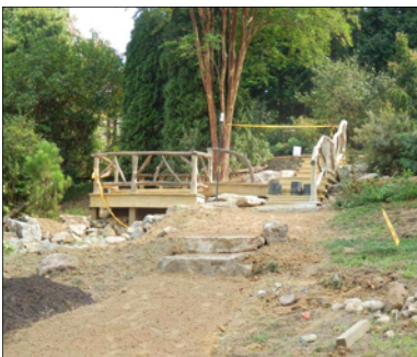
Terrace deck in 9-13

So, we decided to raise some money and move ahead with this new and unique garden design concept. It just had to be good because it was such a great idea, and thus it would win awards in architecture journals and host droves of homeowners wanting to come out and learn about landscaping with natives (or learn about landscaping with anything for that matter). Since we had no money, we wrote a grant application and received some significant money from the Stanley Smith Horticulture Trust in California. Second, I asked the NC Native Plant Society if they would give us $10,000 to help underwrite this ambitious project in return for dedicating my native plants book to them. They (you) did, and I did. And we were greatly encouraged because we now had some financial backing that gave us the confidence to move ahead. We are certainly