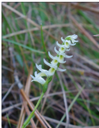
Giant Spiral Orchid