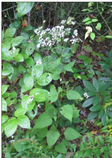
White Snakeroot Ageratina altissima

Garden Phlox, Phlox paniculata : Full to part sun, average moisture. This plant starts blooming in early June and continues through October. It can grow in part shade and can often be found alongside roads and small creeks. Its sweet fragrance attracts many species of butterflies and bees.