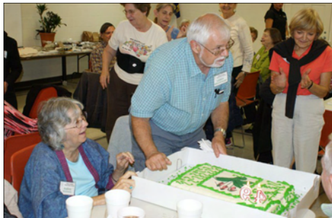
A birthday cake for the esteemed professor was enjoyed at the Fall Trip dinner.

rating collections under the direction of whomever UNC Charlotte’s new horticulturist will be; working at the Reedy Creek Herbarium. He expects to consult with homeowners about their yards, helping them to determine what to plant. He will continue to accept speaking engagements, and to promote his book. And he wonders whether he should write another book. We need one about shrubs for the Southeast, he thinks.