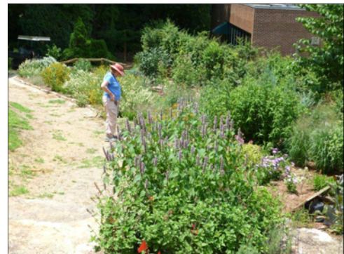
Terrace Agastache, and Monarda, Pycnanthemum in 7-14