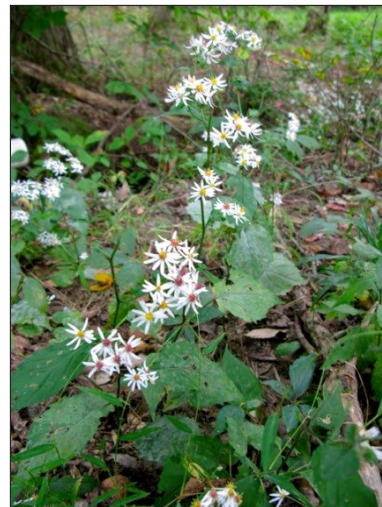
White Wood Aster Eurybia divaricata