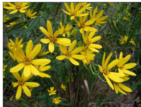
Schweinitz's Sunflower Helianthus schweinitzii