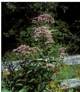
Hollow-stem Joe-Pye Weed Eupatorium fistulosum

native plant societies are critical resources, along with cooperative extension services and university biology departments, for providing education and information to the public on native plant species for each region.