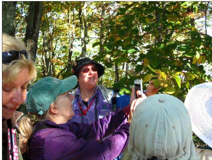
NCNPS members enjoy viewing the beauty of Pilot Mountain natives during the annual Fall Trip.