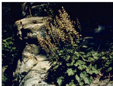
American Alumroot Heuchera americana