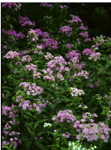
Garden Phlox Phlox paniculata