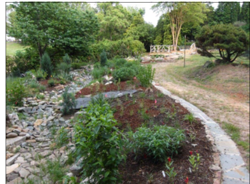
Native Terrace in 5-14