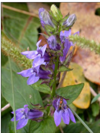
Great Blue Lobelia Lobelia siphilitica

The last few months of the year are the perfect time to plant perennial natives, when seasonal rains soften the ground and the cooler weather allows the ground to retain more moisture to encourage root growth and reduce the shock of transplanting. Let's spread the word to our neighbors and be examples of good stewardship and plant a wide variety of foraging plants for our pollinator heroes!