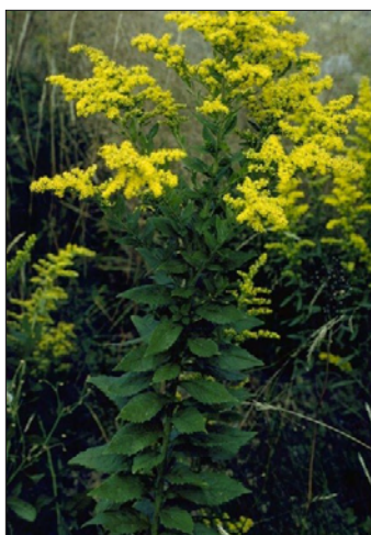
Wrinkle-leaf Goldenrod Solidago rugosa

What can we do to support our native pollinators? At the top of the food chain, we have the means and the knowledge to maintain our helpful insect population. We must continue to add valuable native foraging plants in our gardens and farms, and we must stop the casual use of pesticides. Our