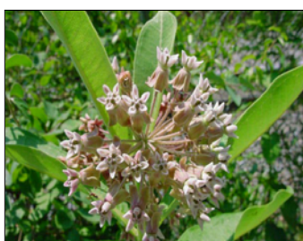
Common Milkweed Asclepias syriaca